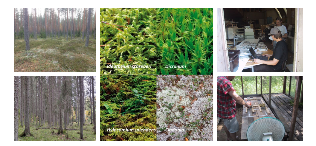
Figure 3 . Center: Studied moss and lichen species in substudies III and IV (cover picture from original article III ), Upper left: semi-xeric mature pine-dominated stand as in substudy III, Lower left: mesic mature spruce-dominated stand as in substudy III, Upper right: drying and weighing work in substudies III and IV , Lower right: The set-up of ignition tests in substudy IV.