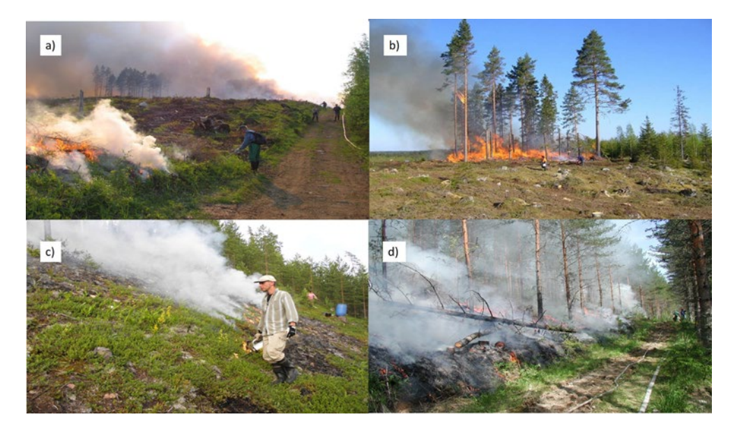
Figure 4. Examples of different types of prescribed burning in Finland: a) silvicultural prescribed burning with retention trees, b) burning of a single retention-tree group, c) habitat management burning of sun-exposed esker slope, d) restoration burning of managed Scots pine stand in a conservation area. From original article II , photos: Henrik Lindberg (a), Juha-Matti Valonen (b), Timo Vesanto (c), Raimo Ikonen (d).

Figure 3 . Center: Studied moss and lichen species in substudies III and IV (cover picture from original article III , photos Erkki Oksanen/LUKE), Upper left: semi-xeric mature pine-dominated stand as in substudy III (photo Henrik Lindberg), Lower left: mesic mature spruce-dominated stand as in substudy III (photo Antti Sipilä), Upper right: drying and weighing work in substudies III and IV , Lower right: The set-up of ignition tests in substudy IV (photos Henrik Lindberg).