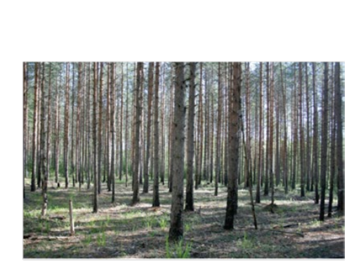
Figure 2. Examples of sample plots in study I . Upper left: Older and thinner stand with low mortality. Lower left: Younger stand with higher mortality. Right: Younger stand with lower mortality.

These 12 stands were inventoried during summer 2010 to estimate the mortality and detect the possible fire scars caused by the experimental fires. All trees were manually examined by looking at visible scars as well as tapping the bark to find hollow areas, indicating potential scars where bark had not yet fallen. In these cases, the scars were revealed by knife. The scars were visually classified by type and their width and height were determined.